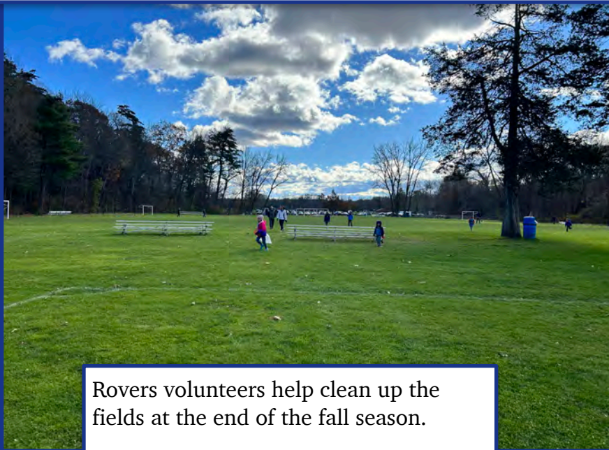
Rovers volunteers help clean up the fields at the end of the fall season.

Thanks to everyone who came out on Sunday, April 7 to help get the Rovers fields ready for spring competition!