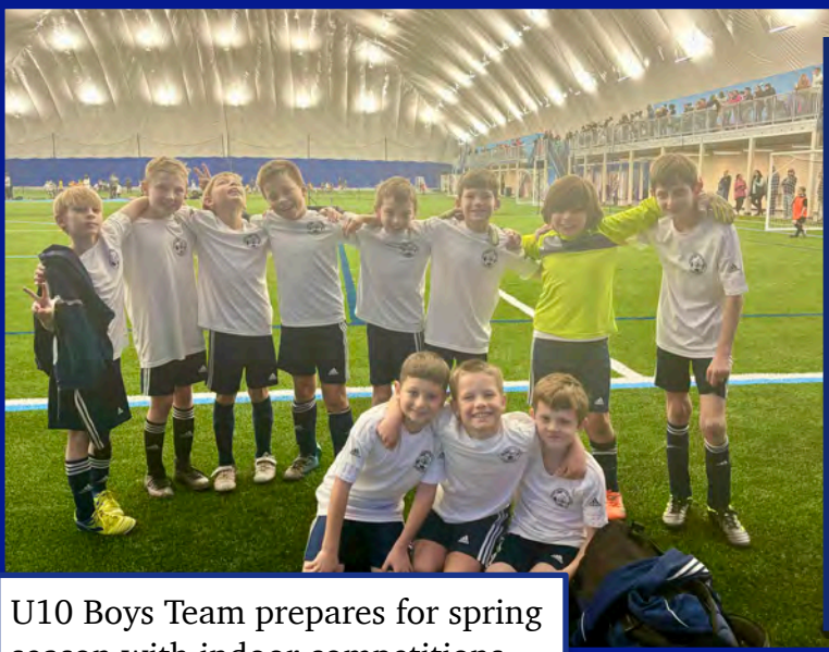
U10 Boys Team prepares for spring season with indoor competitions.

Several Rovers teams brushed up on their soccer skills during the winter with indoor training sessions and games at the new Day Hill Dome in Windsor, Conn.