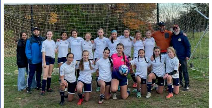
The U14 girls in the final fall season as league champions.