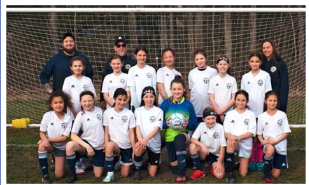
The U14 Girls in 2021 when they won the league (above) and the South Windsor Fall Classic Tournament (below).

Girls, keep your focus, keep learning and play hard. Always be a good sport, but play hard. High school will be tough, lean on each other. You are teammates and teams can be like family. Heads up no matter what. If you played your best, the outcome doesn't matter.