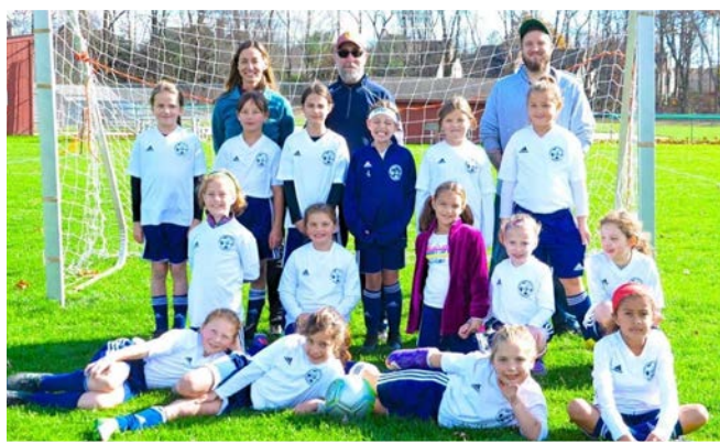
The U14 girls back when it started in 2019.