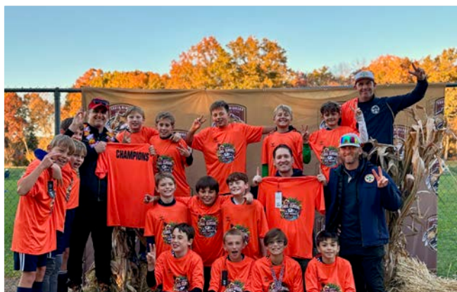
U12 Boys celebrate tournament victory at South Windsor Fall Classic.