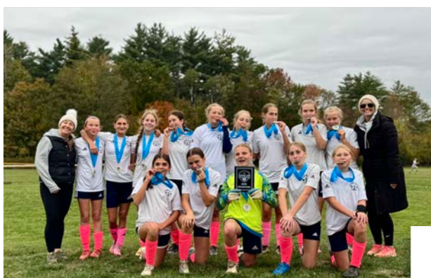
U15 Girls show off their championship medals at the Capital Cup in New Hampshire.