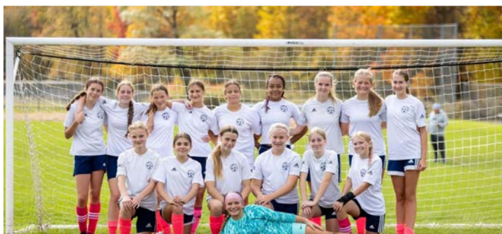
U15 Girls finish tied for first in their league in their last fall season before high school.